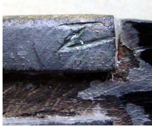
Figure 5. Detail of a mark cut into interior fold of bronze end cap. The meaning of this “Z,” or “2” is not known.

A folding blade does so for two reasons: to protect the user from being cut while carrying it, or to protect the blade from being damaged (or, of course, both). One suggests portability or concealment, and the other, fragility to the edge that comes with extreme sharpness. The sheath was designed to not only cover the sharp edge, but the curvature served to enclose the tip as well.