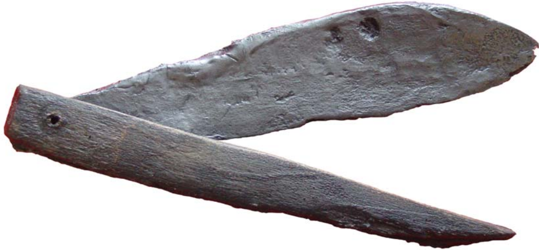
Figure 1. A navaja recovered from the 1622 galleon Nuestra Señora de Atocha . The blade is an epoxy replica cast from the marine concretion, and the sheath has broken at one end.

Reprint from The Navigator: Newsletter of The Mel Fisher Maritime Heritage Society , Vol.21, No.4 July, 2005