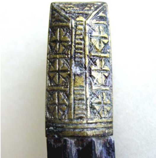
Figure 4. Detail of decorative bronze end cap. These engraved pieces of sheet metal were folded over the end of the wooden sheath. At the center is the hole for the blade to attach to and pivot open from.

Judging from the evidence presented by the sheaths, these knives would not have been particularly strong. The wood is thin for the length, and many of the examples in the MFMHS collection are cracked or broken. The pin holding the blade was also small, and coupled with the slight sheath, would not have provided much resistance against twisting or torque.