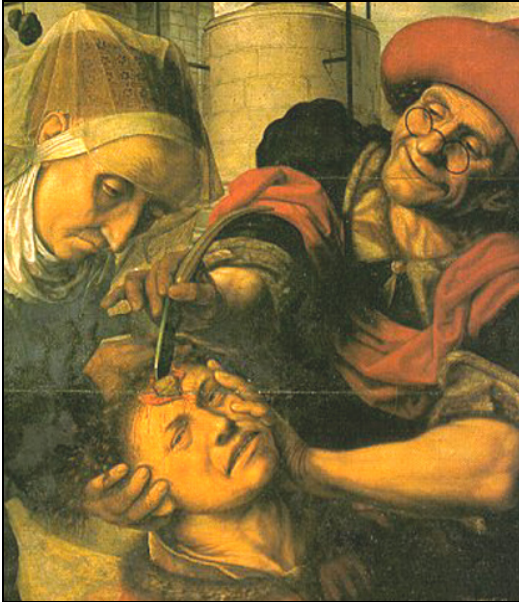
Figure 2. Detail from The Surgeon showing a navaja-type knife being used to perform surgery. Painting by Jan Sanders van Hemessen, ca. 1555. Museo del Prado, Madrid, Spain.

cover them, did these knives really serve such specific purposes on the ships? Or were they much more versatile? The word navaja itself is certainly suggestive of this. The term is interchangeable for both folding knives and razors 1 .