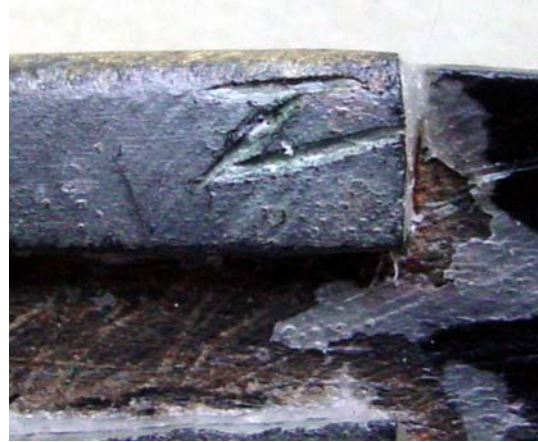
Figure 5. Detail of a mark cut into interior fold of bronze end cap. The meaning of this “Z,” or “2” is not known.

A folding blade does so for two reasons: to protect the user from being cut while carrying it, or to protect the blade from being damaged (or, of course, both). One suggests portability or concealment, and the other, fragility to the edge that comes with extreme sharpness. The sheath was designed to not only cover the sharp edge, but the curvature served to enclose the tip as well.